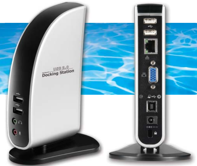
DU2771 (VGA) DU2781 (DVI)

Enhanced expansion capability plus the stylish appearance, surely this docking station with video is the most versatile accessory that also complements your home or office space.